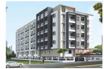
MATHA Residency Mulky NH66, Mulky