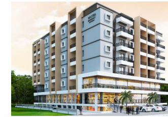
MATHA Residency, Padubidri N.H 66, Padubidri