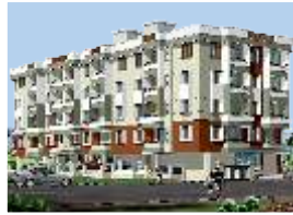
MOOKAMBIKA Residency Near Railway Station Surathkal, Mangalore