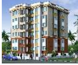
MATHA Residency Kaup, N.H 66, Udupi