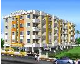
KATEEL Residency Mukka, Surathkal