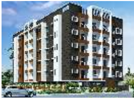
PANCHADURGA Residency Bappanadu, Mulky