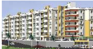
MATHA Residency Opp. Mount Carmel Central School, International Airport Road Maryhill, Mangalore