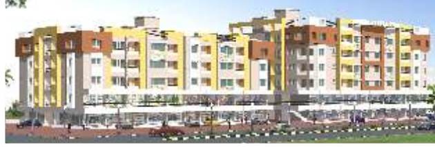
MATHA Residency N.H-66, Near Mulky Railway Station, Haleyangadi, Mangalore